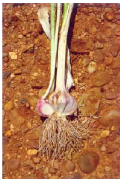
Section of a garlic bulb in the stage of cloves differentiation, affected by cold-excess