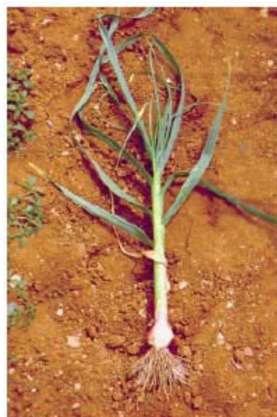
Garlic plant in the stage of bulb developing, showing symptoms of cold-excess