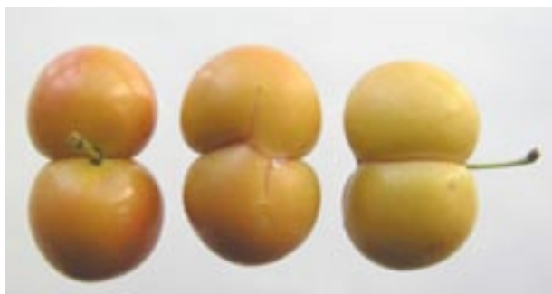
Figure 6. Fruit doubles of mirabelle

Peach trees which were well watered during August and September had significantly fewer fruit doubles than trees which were under stress during those months. Growers reported increased