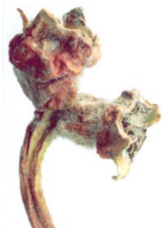
Figure 8. Fruit doubles of apple. Both fruits were smaller than normal, and their development remained retarded

problems with fruit doubles, providing further evidence to support the critical need for timely irrigation in successful peach production (JOHNSON et al. 1992; STRIEGLER 2000).