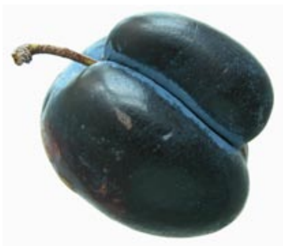
Figure 4. Spured fruit of plum