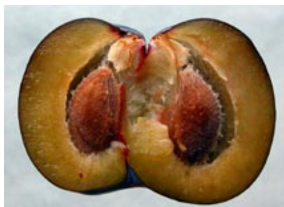
Figure 3. Cross section through a fruit doubles in plum