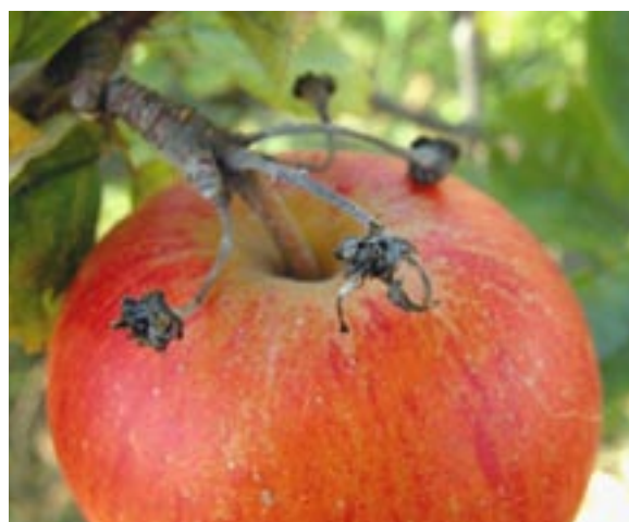
Figure 7. Apples spur with fully developed terminal fruit while basal fruits are retarded