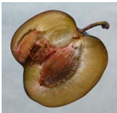
Figure 5. Cross section through spured fruit of plum

Peach trees which were well watered during August and September had significantly fewer fruit doubles than trees which were under stress during those months. Growers reported increased