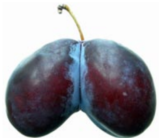
Figure 2. Fruit doubles of plum