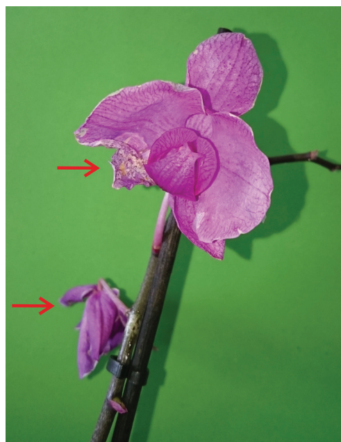
Figure 1. Visible injuries on Phalaenopsis orchid flowers caused by Dichromothrips corbetti

Hundreds of specimens, especially adult females and larvae, were obtained on potted orchid ( Phalaenopsis spp.) cultivars in two distant stores (first: